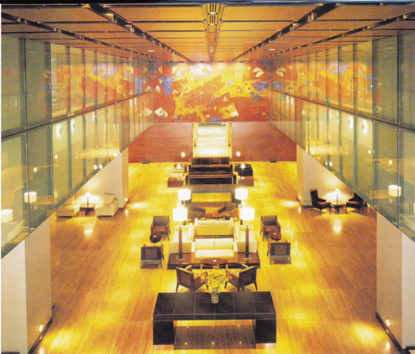
Lobby at the soon-to-open Hilton Mexico City Reforma.

El Taj Oceanfront will open next month in Playa del Carmen, part of Condo Hotels Playa del Carmen . With a Bali-inspired design, elegant amenities and gorgeous views of the Caribbean Sea, El Taj is one of several condo-hotels making waves in the travel landscape. Accommodations at Condo Hotels Playa del Carmen vary from 1-bedroom apartments to 3-bedroom penthouses; rates start at $265 per night.